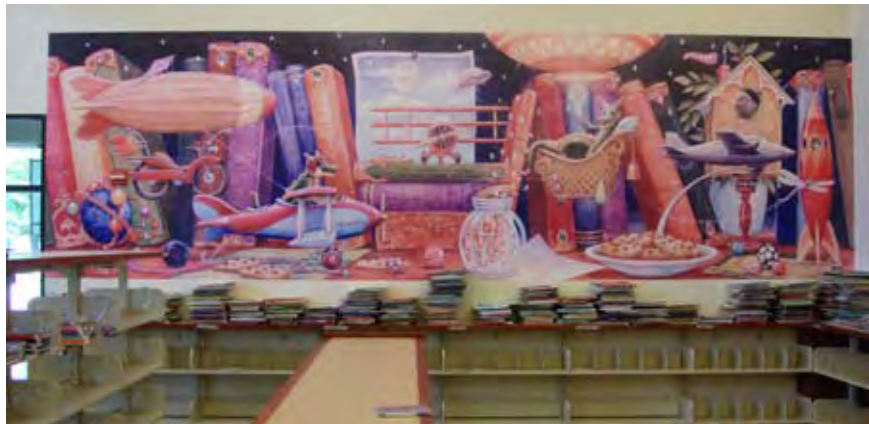
The children's corner of the new library sports a colorful mural six feet high by nearly 20 feet wide!

A nutrition program is being developed by the Department of Aging and Social services. The nature of this program is still to be determined, and the target date for beginning the program is for later this fall.